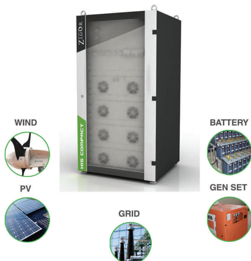
ZIGOR SOLAR HIS1 COMPACT

The Zigor ZIGOR SOLAR HIS1 COMPACT series of Hybrid Inverters have a modular and scalable concept where it is very easy to increase the capability by increasing the size of the PV field, the number of Wind Turbines, the power of AC input and/or the size of the battery bank.